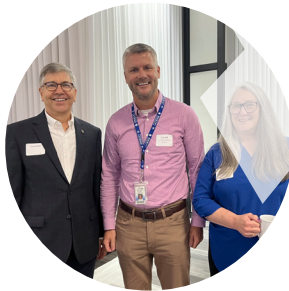
AUGUST 2024 Kick-off Breakfast Energizing the community for our annual campaign