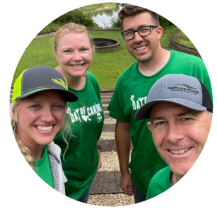
JULY 2024 Day of Caring Volunteer event for corporate partners