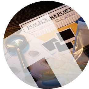
OCTOBER 2024 Whodunnit Dinner A night of food, fun, and detective work

Learn more about these sponsorship opportunities on pages 4-8.