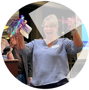
MARCH 2024 Annual Celebration Celebrating success over the past year